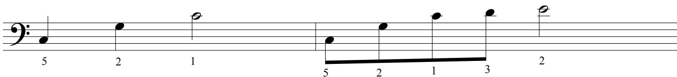
Arpeggiated chord (this pattern is used often in pop music)